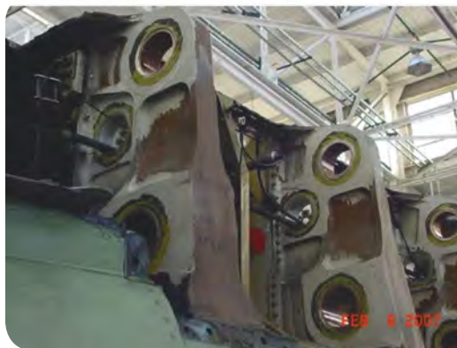
FIGURE 1 Corrosion in F-18 wing-fuselage attach bulkheads. 8

The model requires the polarization curve in the corroding electrolyte (usually 3.5 or 5% sodium chloride [NaCl]) for each surface chemistry in the assembly (CuBe, Cd, Al, etc., and coatings such as Cd and anodizing), since this is what determines the galvanic potential and galvanic current at each location on the surface. The polarization curves are obtained following the requirements of a best practices guide